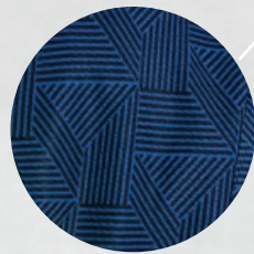
Navy print contrast fabric